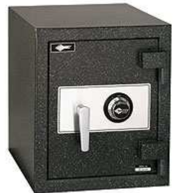
American Security's BF1512 Home Security Burglary & Fire Rated

number of hours ½, 1, 2, 3, or 4. Class 350 is for valuable papers which start to char at over 400°F. Class 125 is for protecting magnetic media such as video tapes, computer back-up drives and floppy disks which can't tolerate the temperatures that paper can.