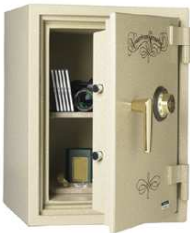
American Security's ULS1812 Home Security Fire Safe Class 350-2

It was in the late 1800s that cast iron began to be used to create thick walled metal boxes. What had originally been known as a strong box